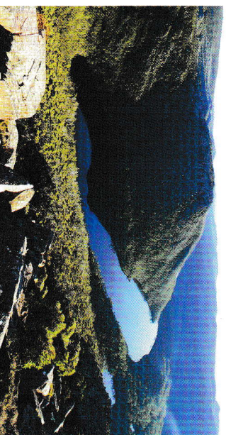
Lake Seal