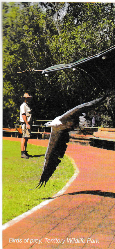
Birds of prey, Territory Wildlife Park