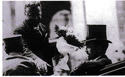
President Teddy Roosevelt & Cornelius Vanderbilt III, 1910

a Morning Room adorned with platinum leaf wall panels. Its interiors feature rare marble, alabaster, and gilded woods throughout.