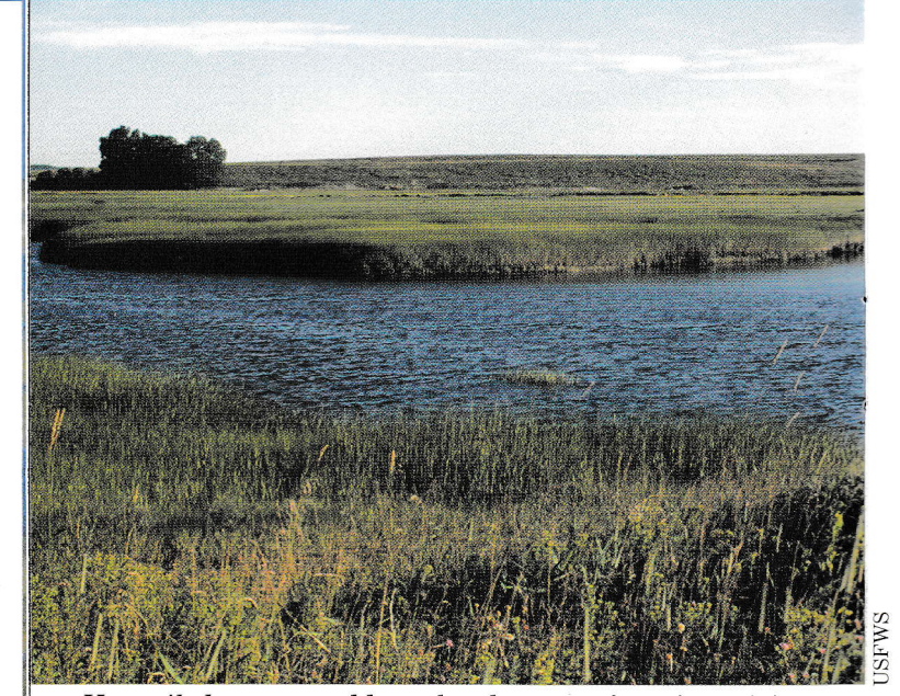
Unspoiled scenery adds to the pleasure of a refuge visit.