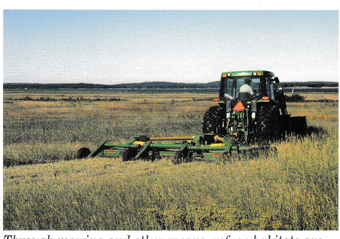
Through mowing and other means, refuge habitats are sometimes manipulated for the benefit of wildlife.