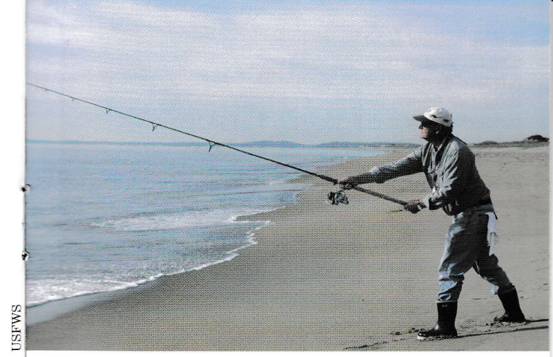
An early morning fisherman casts a line from the refuge beach in hopes of landing a "striper."

A checklist of refuge birds is available from refuge headquarters and the entrance gatehouse when staffed.