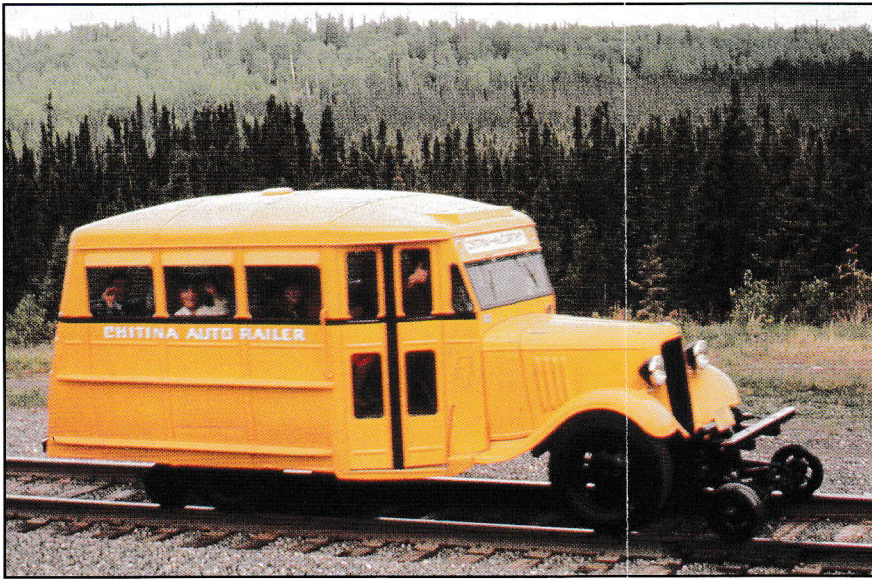
Above; "Chitina Auto Railer" 1935 Chevrolet Bus fitted to operate on the railroad tracks. Used in Chitina/Copper Center area. Below; Land clearing, Matanuska Valley Colony Project, 1936.